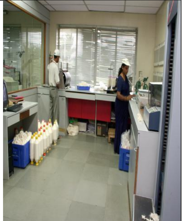
SHIRPUR, MANUFACTURING PROCESS (weaving unite )