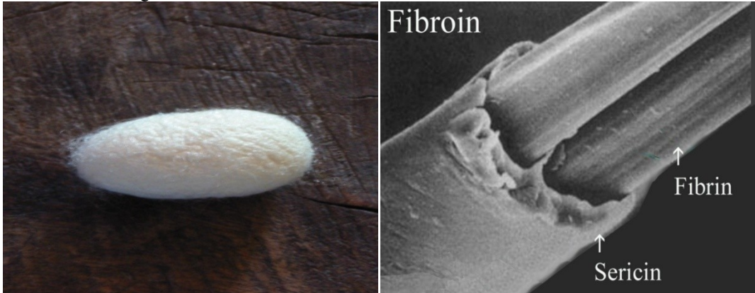
Fig 1: Raw Silk Cocoon

India is the second largest producer silk in the world and has the distinction of the producing all the four varieties of silk. Silk consists of two types of proteins, silk fibroin and Sericin. Sericin contributes about 20-30 percent of total cocoon weight. It is high content of serine and 18amino acids, including essential amino acids. There are different methods of isolation of Sericin from silk thread. Solubility molecular weight, and gelling properties of Sericin depends on the method of isolation. It has wide applications pharmaceuticals and cosmetics such as, wound healing, bio-adhesive moisturizing, anti-wrinkle and anti-aging. Degumming was carried out in an aqueous medium using high temperature, HTHP beaker dyeing machine and IR dyeing machines. The Sericin liquor extracted by using optimized conditions was converted into powder using a laboratory spry dryer keeping inlet temperature at 110<sup>o</sup>C and the atomization pressure at 3-4kg/cm<sup>2</sup> [1]. As DMEHEU is a formaldehyde-released cross-linking agent for cotton fibers/fabrics which could cause irritation to skin. In this present work substitute it by non-formaldehyde released cross-linking agents such as glutaraldehyde (GD) has been used as cross-linking for cotton fabric.