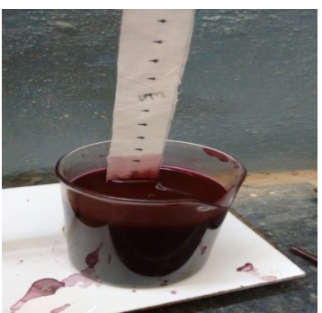
Fig 3 Controlled sample

Wicking property of cotton fabric has been reduced after it has been treated with Sericin gum with cross linking agents. Table no.2 shows the wicking height of both warp and weft of controlled sample and treated samples. From the table it clearly understood that the absorbency property of cotton fabric after the treatment has reduced drastically. This is because of after the treatment the Sericin gum present in the surface of the fabric acts as a barrier for the water molecules to enter into the fabric.